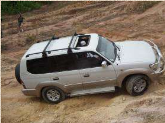
Gary in Action